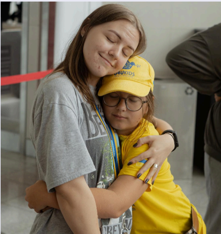
Uniting for Ukrainian Kids participants, Atlanta, Georgia, April 2024

The second aspect is that we seek host families in America—we aim for 18 families per trip. It doesn’t matter what language they speak: Russian, Ukrainian, English, Spanish—it is only very important that they support Ukraine and are prepared to receive the children. The children are aged between 13 and 16—we saw that if they are younger than that, it is just fun. Even though rehabilitation in a safe place is a positive thing, we want to provide more than that—to show that there is another kind of life, not just what they have seen in small Ukrainian towns. Their experience in America greatly