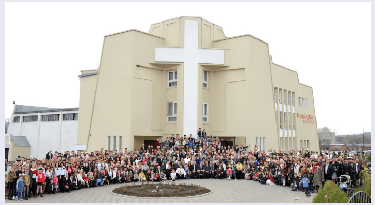
Good News Church in Sloviansk, 2011

The situation actually turned out like this. A son of mine who was studying in the US state of Georgia decided to get married there on 6 February 2022. My wife and I flew to America for the wedding along with our two eldest children. I have ten children in all, two biological and eight adopted. One of my elder sons and the two youngest children remained at home in Sloviansk. We had return tickets for 3 March 2022, but