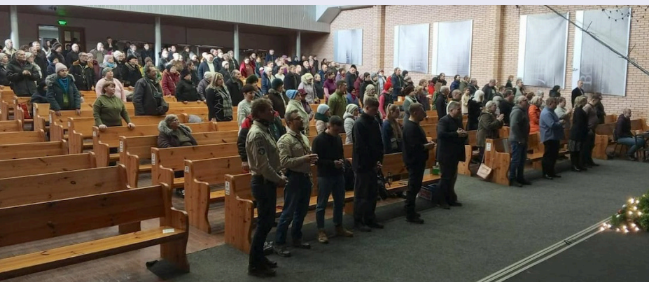
Christmas worship at Good News Church, 2022