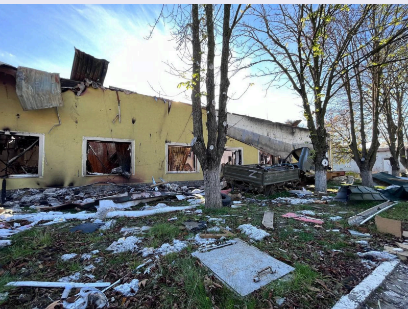
Above and top right: The devastated site of Tavriski Christian Institute, seen following liberation from Russian occupation in November 2022