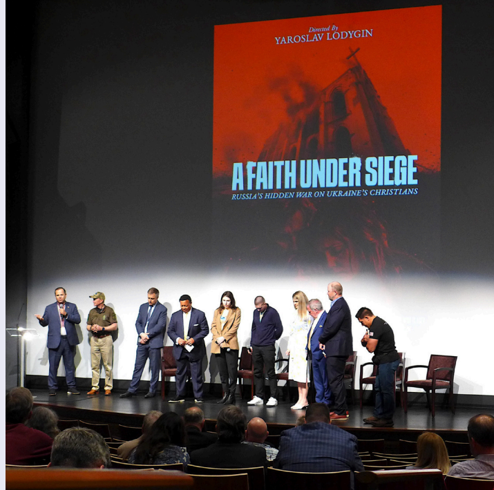
Closing prayer following the premiere of A Faith Under Siege in Washington, DC on 6 May 2025

This issue of the East-West Church Report features interviews with Ukrainian Evangelicals active in dialogue with their American counterparts, including at Ukrainian Week . ♦