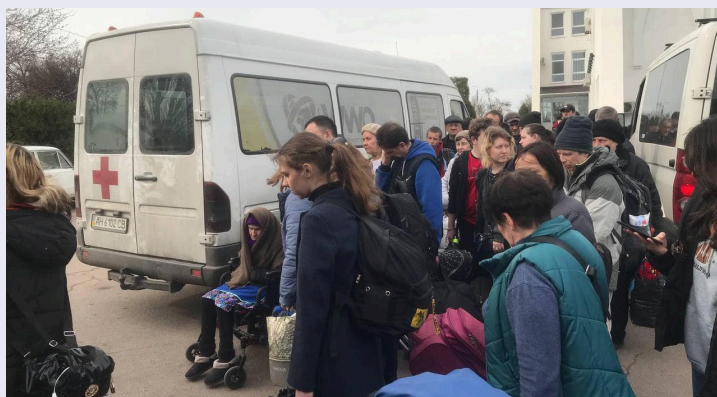
Evacuation outside Good News Church in Sloviansk, April 2022