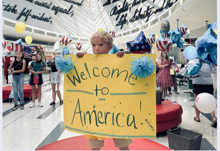
Airport welcome, September 2023

During the third week we organize a camp for the children, either just during the day or else residential. Here, there is a special program for the children where they can talk about values, the future, and see that they have prospects. In this way the children receive everything we can give them over three weeks while also being able to observe relationships in their host family. Of course they often also receive presents, but in most of the feedback I have heard the children say that