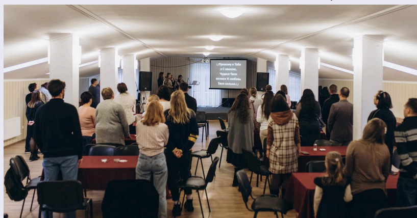
Worship at Tavriski Christian Institute in November 2021, prior to Russian occupation

Yes. My grandfather on my father’s side was a prisoner of war in Germany. Soon after his return he came to faith. My grandmother was already a devout Protestant, and they encountered very intense persecution under the Communists—they were fired from their jobs and attempts