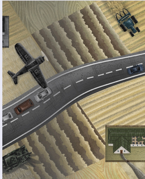
Cover illustration for the Ukrainian version of Serving God Under Siege