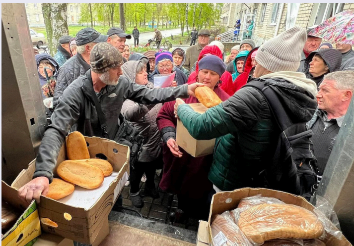
Good News members distributing bread, April 2023

For as long as I had a US visa, I would spend a month or six weeks in Ukraine, then a month with my family in [the US state of] Georgia, alternating in this way seven times. During these trips, as I was traveling through western Ukraine on my way to Sloviansk, I might post on Facebook, for example, “Tomorrow I will be in Dnipro. If you are from my church,