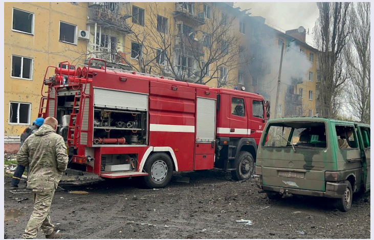
Aftermath of Russian attack on Sloviansk, April 2023

It is possible to live with those two losses. There are 10 million Ukrainians who were displaced or had to move abroad, not just me. But the other two losses are very painful. First, the loss of people in the church with whom you have lived your life, children whom you blessed, reared, married. These people are precious, and you understand that you will never gather in the same way ever again. People have left—obviously some