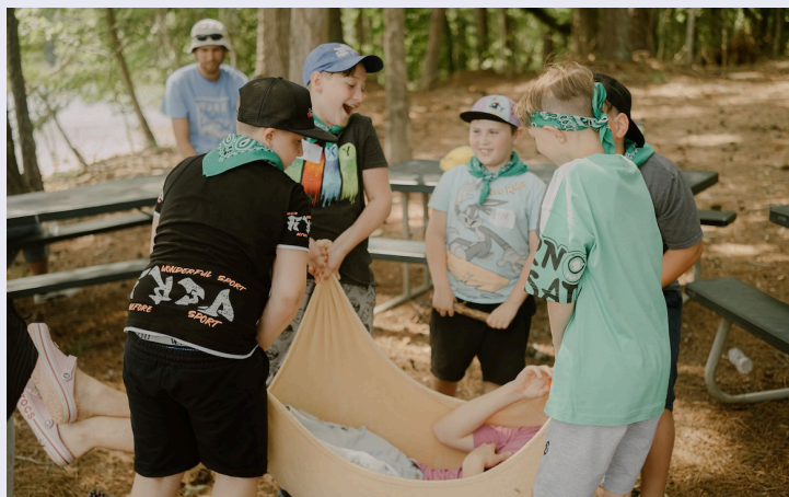
Uniting for Ukrainian Kids camp in Atlanta, Georgia, March 2025